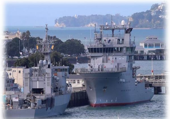
The future Royal New Zealand Navy dive and hydrographic vessel at Devonport Naval Base

She pulled into Auckland at the end of a long delivery voyage from Denmark. The second-hand, fully refurbished vessel is currently civilian registered with the name Edda Fonn. She will be formally commissioned into Royal New Zealand Navy service in June by Prime Minister Jacinda Ardern and renamed HMNZS Manawanui.