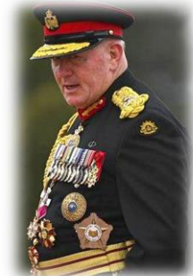
His Excellency General the Honourable Sir Peter Cosgrove AK MC (Retd)