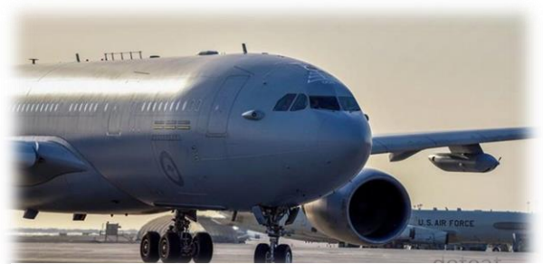
A Royal Australian Air Force KC-30A Multi-Role Tanker Transport lands at the main air operating base in the Middle East Region.

"The KC-30A can operate at long ranges, delivering significant payloads of fuel to a wide variety of Coalition aircraft," Group Captain Long said. The aircraft is equipped with two forms of air-to-air refuelling systems, which allow it to refuel almost all aircraft in theatre, including all F/A-18 Hornet variants, F-16 Falcons, AV-8B Harriers, Eurofighters, Dassault Rafales, C-17A Globemasters and more. The last time our KC30A was in the Middle East, it clocked up its 100,000,000th – yes, that's 100millionth – pound of fuel delivered during air-to-air refuel missions on Operation Okra.