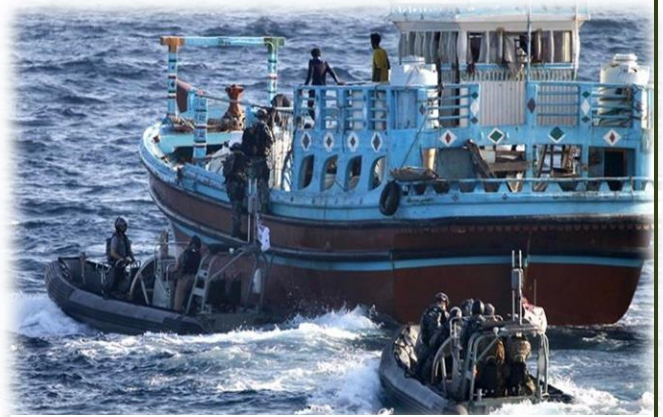
HMAS Ballarat's boarding party conduct a boarding of a suspicious show.

The Australian Navy frigate has now seized nearly 13tonnes of hashish, 1.4 tonnes of heroin and a small quantity of methyl amphetamines, with a combined street value of AUD$1.073 billion*.