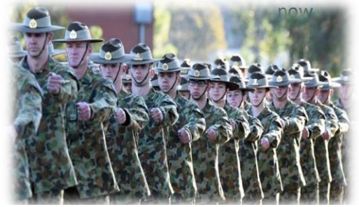
Australian Army recruits in training at 1st Training Battalion, Kapooka, NSW

Recruits will also receive foundation training in chemical, biological, radiological and nuclear defence and be required to pass a PESA (physical employment standards assessment) before marching out of Kapooka.