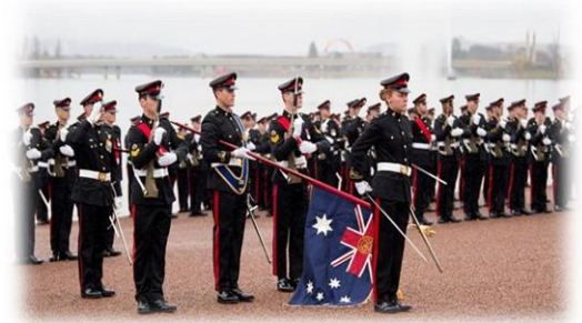
Royal Military College Corps of Staff Cadets and the Colour Party giving a Royal Salute during the annual Queen's Birthday Parade at Rond Terrace, Canberra.

General Sir Peter Cosgrove will be replaced as Governor General of Australia later this month, by General ( Retd ) David Hurley AC, DSC, FTSE, current Governor of New South Wales. Sir Peter is the 26 th Governor General since Federation in 1901 and only the 12th Australian to hold the post. He was sworn in as Governor General on 28 March 2014, taking over from Dame Quentin Bryce AD CVO.