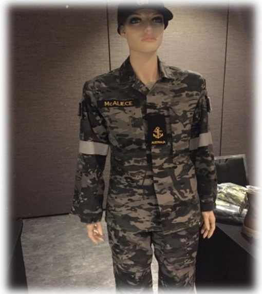
This is the replacement of the Disruptive Pattern Print (DPP)-derived Disruptive Pattern Naval Uniform (DPNU) with the MCP-derived Maritime Multicam Camouflage Uniform (MMCU) for the Royal Australian Navy.

The fabric is produced by Bruck Pty Ltd, while the garments are manufactured by Australian Defence Apparel.