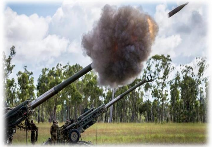
A SMArt 155 munition is fired from an Australian Army M777 howitzer, from 107 Battery, 4th Regiment, Royal Australian Artillery during Exercise Chimera at Shoalwater Bay.

Exercise Chimera was conducted on 24 and 25 March by three regiments of the Royal Regiment of Australian Artillery – Townsville-based 4th Regiment, Darwin-based 8th/12th Regiment and Brisbane-based 1st Regiment.