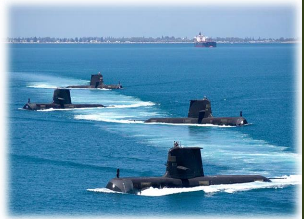
Collins-class submarines HMAS Collins, HMAS Farncomb, HMAS Dechaineux and HMAS Sheean

Minister for Defence Christopher Pyne said the service would be based in Western Australia and support both the Collins-class submarine force and the Attack-class submarines for the next 25 plus years. "The new system is being designed and built specifically to support the capability requirements of the Navy and will be both air and road transportable, capable of being deployed on a range of vessels