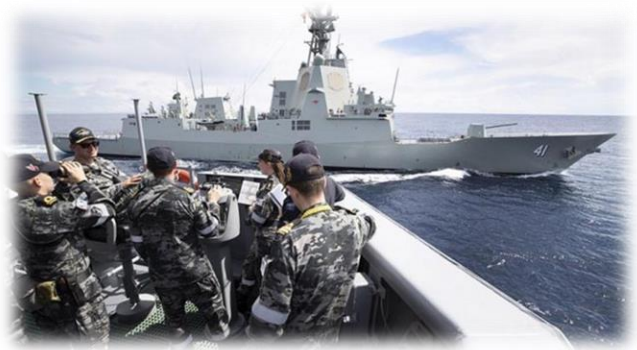
HMAS Melbourne’s crew trial the prototype Maritime Multi-cam Pattern Uniform at sea, in company with HMAS Brisbane.

The fabric is produced by Bruck Pty Ltd, while the garments are manufactured by Australian Defence Apparel.